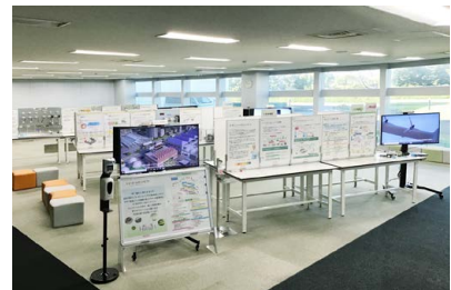
Permanent showroom (Agui Plant)

Furthermore, through such activities we gather information on the issues and requests of suppliers based on which we make suggestions to industrial organizations and other groups. With these efforts, we are helping to create environments that facilitate sustainable activities across the entire supply chain.