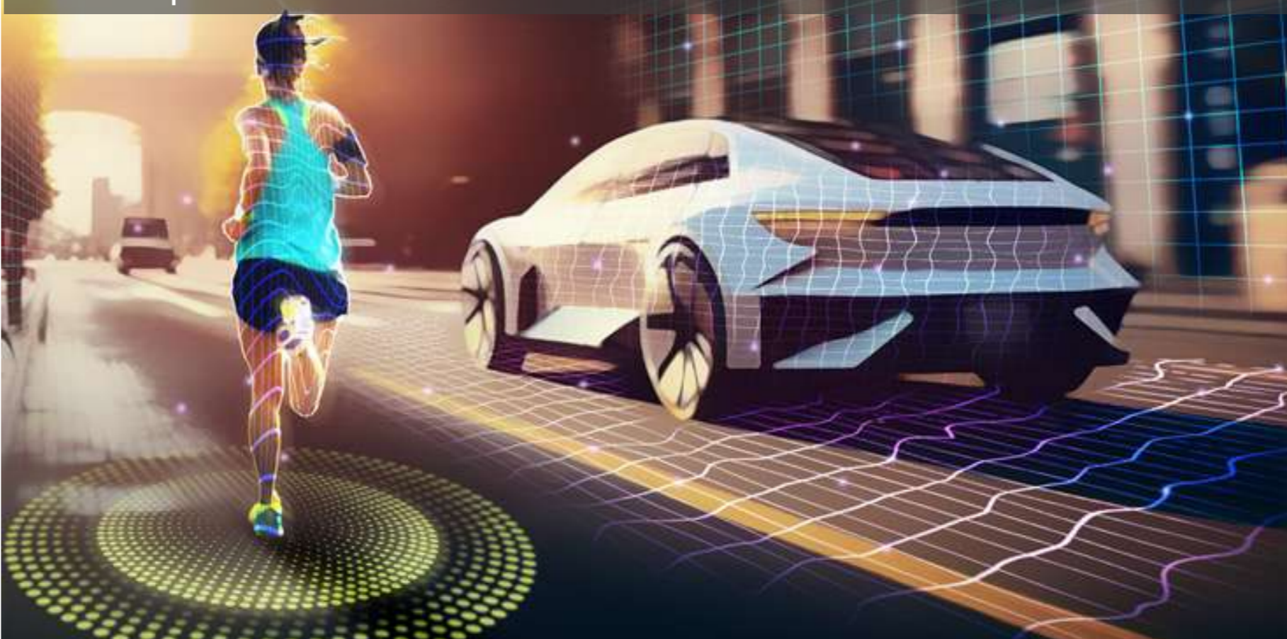
[VR] Intuitive Interaction by 360-Degree Perception