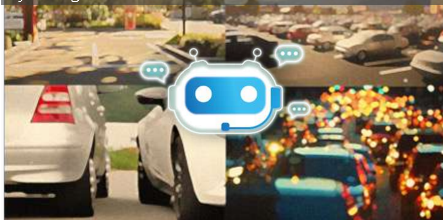
[VR] Smart parking support by AI agent